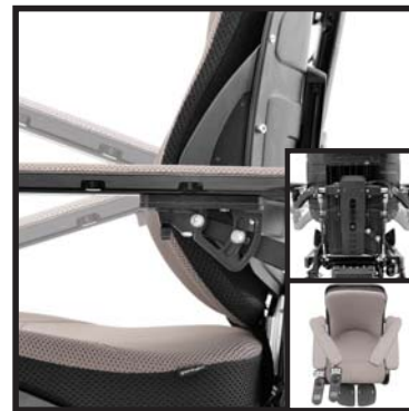
Independently adjustable armrest height, angle and pitch