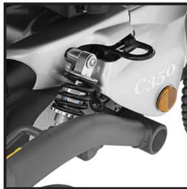
4-wheel adjustable independent suspension