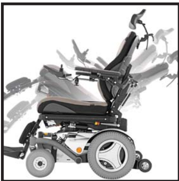
50° of tilt with two range selections