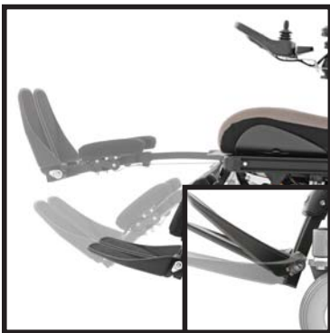
Power adjustable legrests with independently adjustable legrest height and footplate angle