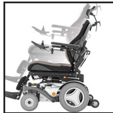
8" power seat elevator