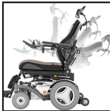
150° power recline